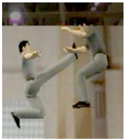
Previsualization helped to determine the position, speed and movement of the characters in the factory fight scene. Ultimately, Jet was photographed twice, once as Gabe and once as Yulaw, using a cable rig and speed controlled cameras, and then composited together in post.

View this article online at Apple Computer's website for creative professionals: