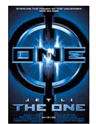
See the movie trailer for The One.

Power Mac G4 dual processor Final Cut Pro LightWave 3D by NewTek Poser by Curious Labs Poser Pro Pack by Curious Labs Canon GL1 DV Camcorder